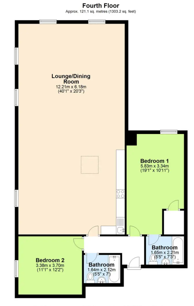
Total area: approx. 121.1 sq. metres (1303.2 sq. feet)