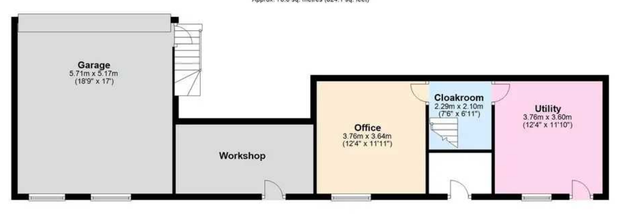
Ground Floor Approx. 105.2 sq. metres (1131.9 sq. feet)

Basement Approx. 76.6 sq. metres (824.1 sq. feet)