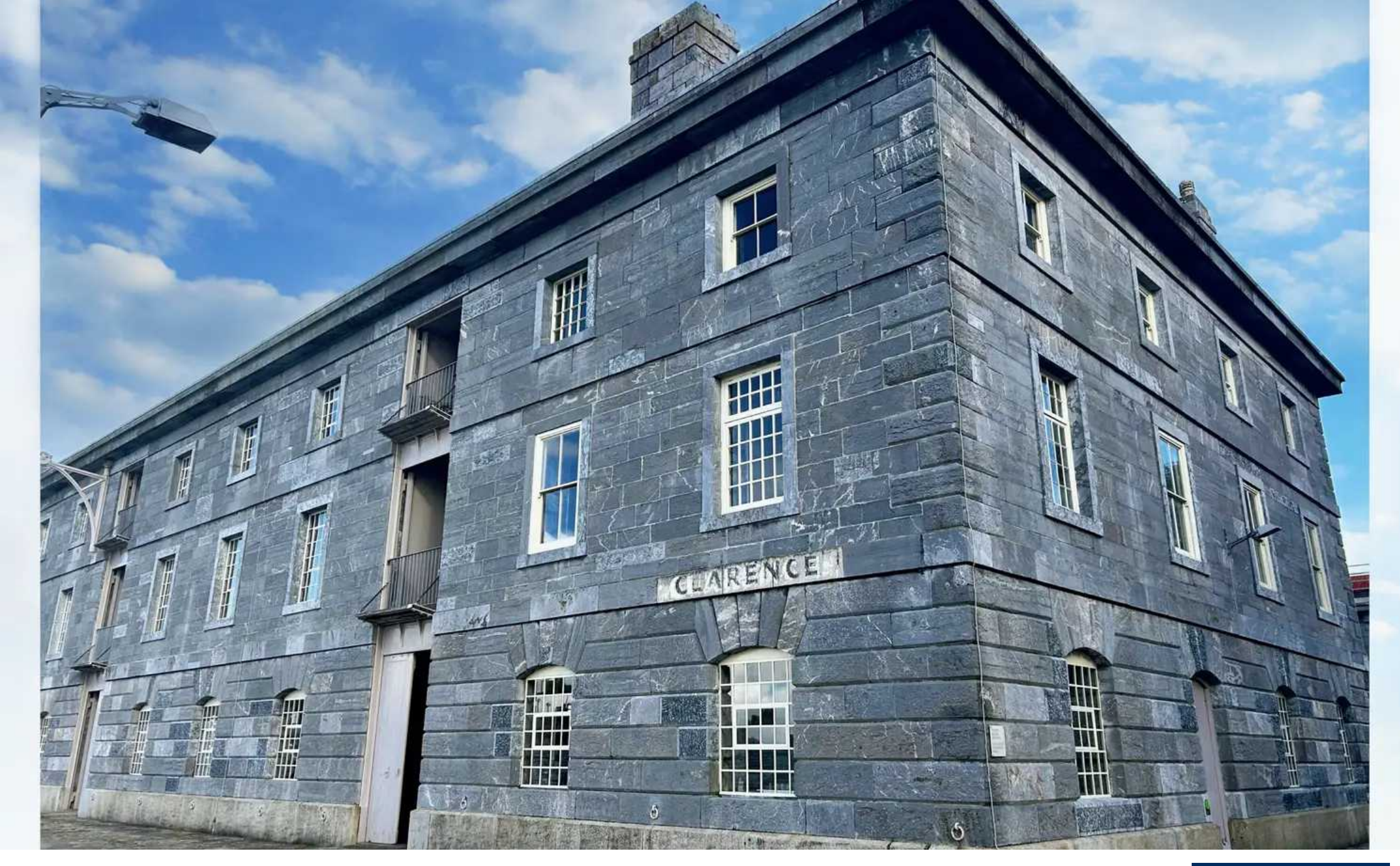
Clarence, Royal William Yard, Plymouth, PL1 3PA