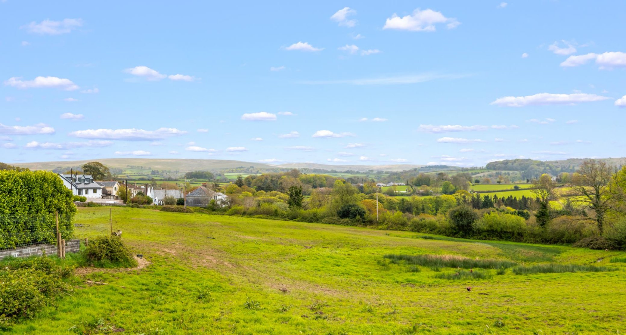
Marle Cottage, Yondertown Square, Luton PL21 9SH