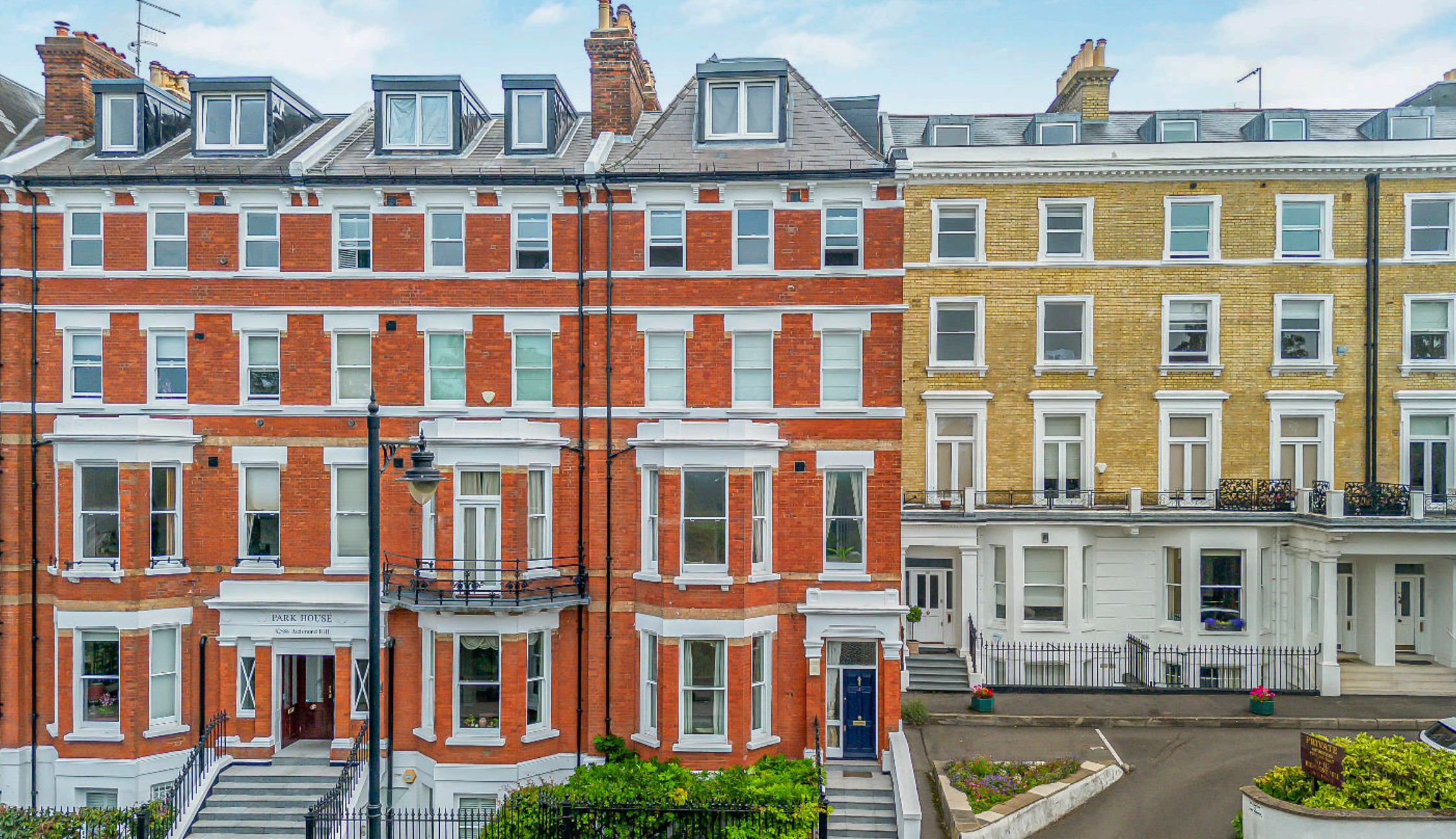
Park House, Richmond Hill, Richmond TW10