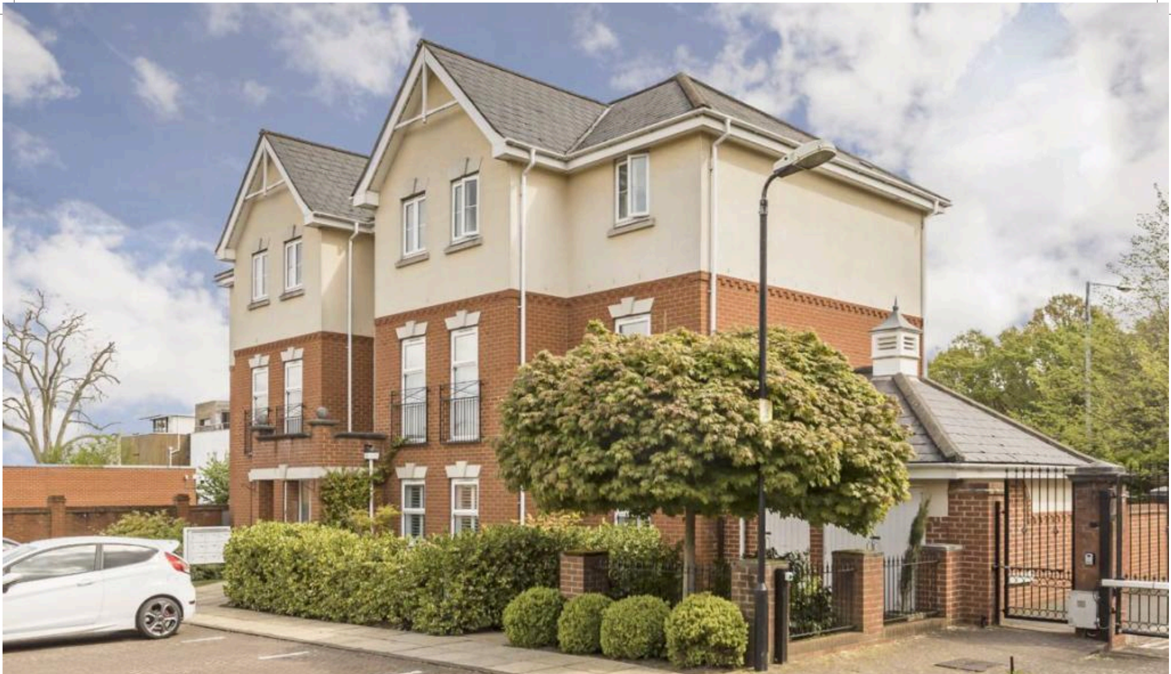
Floyer Close, Richmond TW10