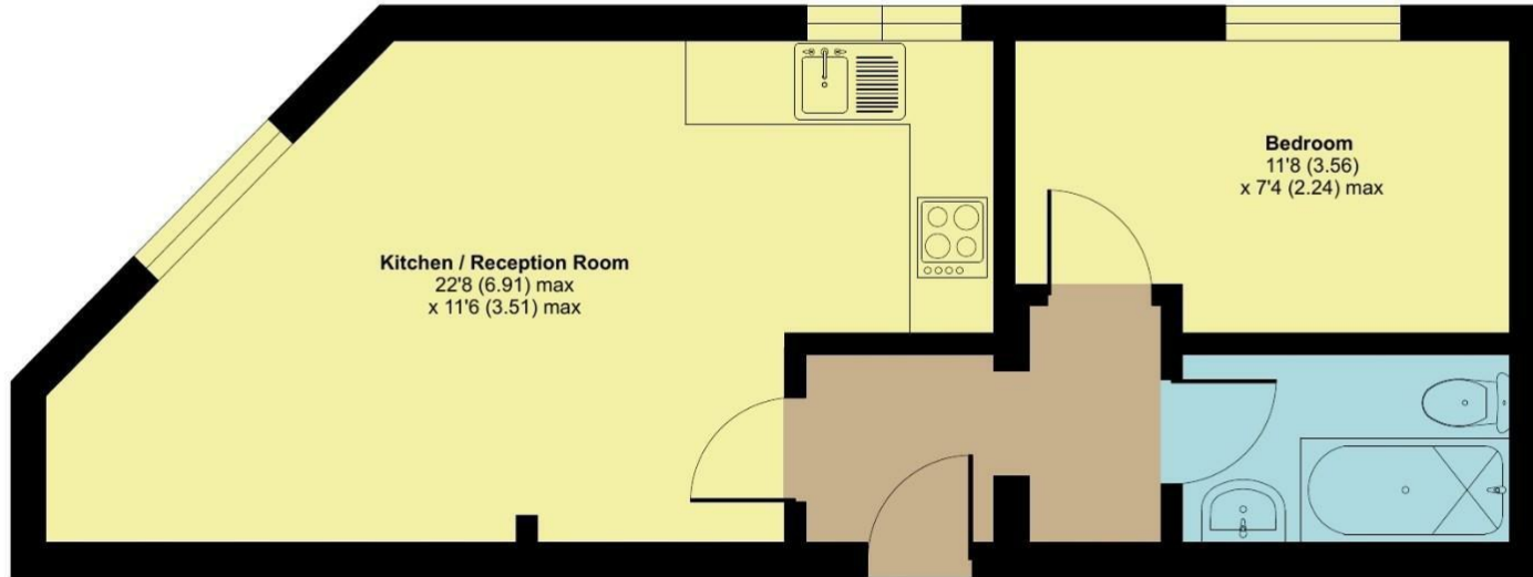
SECOND FLOOR APPROX FLOOR AREA 35.7 SQ M (385 SQ FT)

RICS Certified Property Measurer Floor plan produced in accordance with RICS Property Measurement Standards incorporating International Property Measurement Standards (IPMS2 Residential). © nichecom 2024. Produced for Hunters Property Group. REF: 1110467