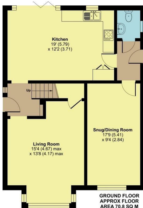
GROUND FLOOR APPROX FLOOR AREA 70.8 SQ M (763 SQ FT)