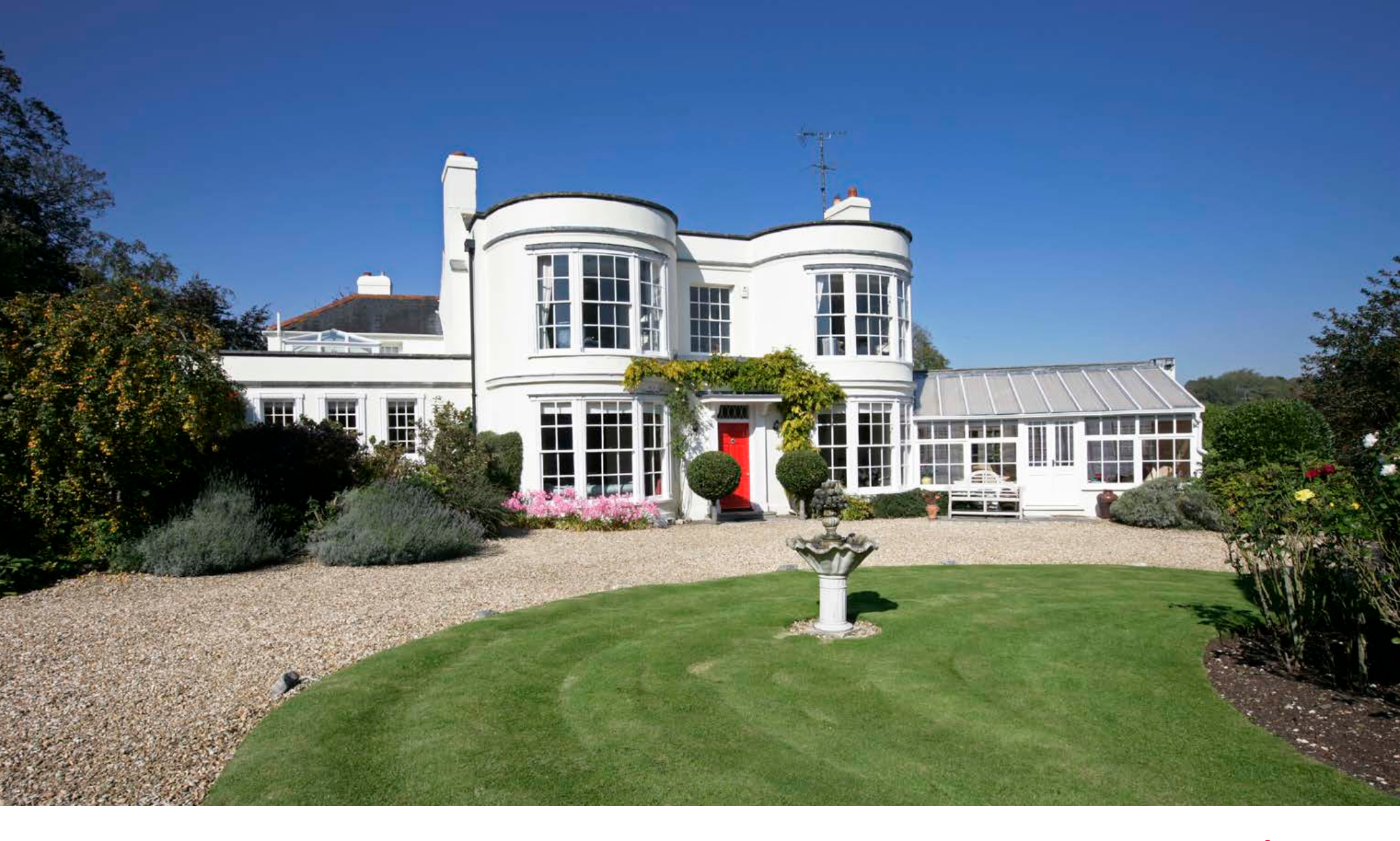
The White House, Osmington, Dorset