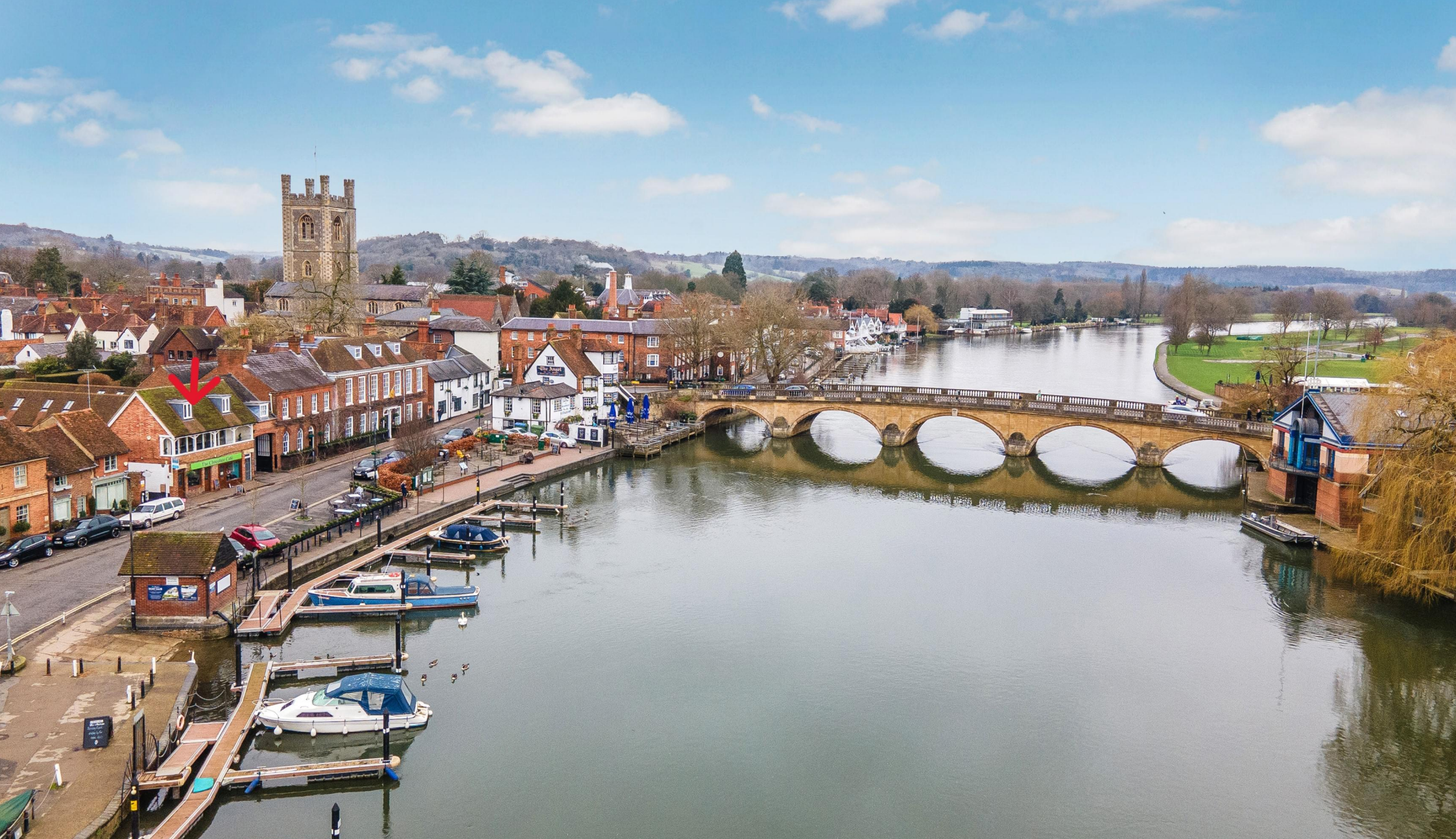
Thameside, Henley-on-Thames, Oxfordshire