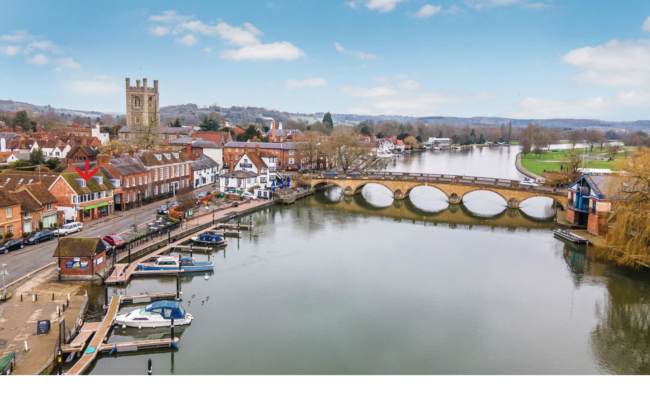
Thameside, Henley-on-Thames, Oxfordshire