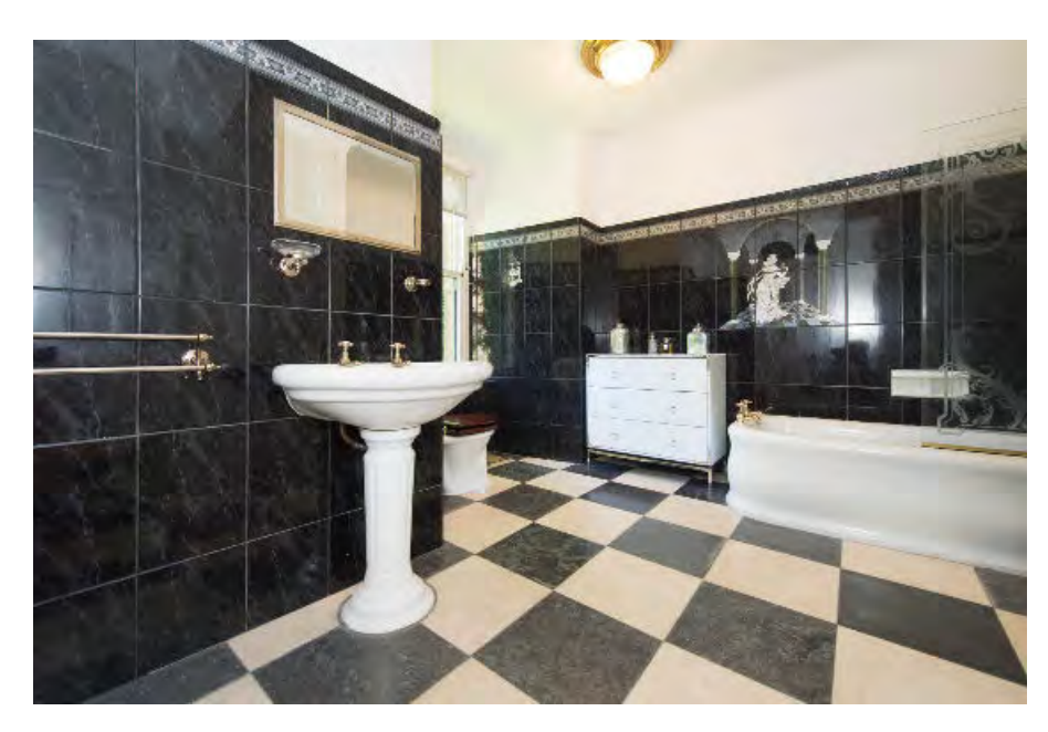
Stunning original fittings.