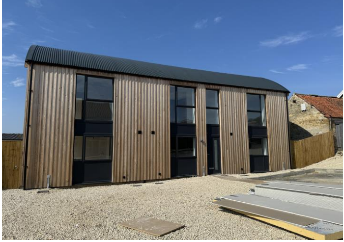
Air source central heating with underfloor throughout the ground floors and radiators upstairs. Attractive contemporary finishings to the bathroom and kitchens

Unit 6 is situated within a unique new build, designed to look like a Dutch Barn, with a nod to the sites heritage, each property is clad in red cedar and with anthracite aluminium doors and windows.