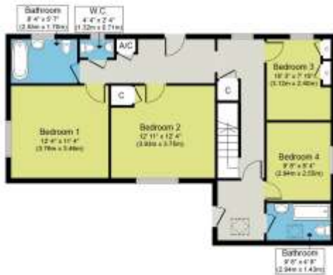
Ground Floor Approximate Floor Area 824 sq. ft. (76.6 sq. m.)