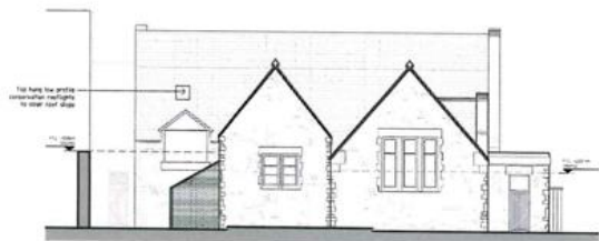
04 Proposed Elevation - West 1:100