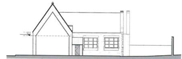
05 Proposed Elevation - North 1:100