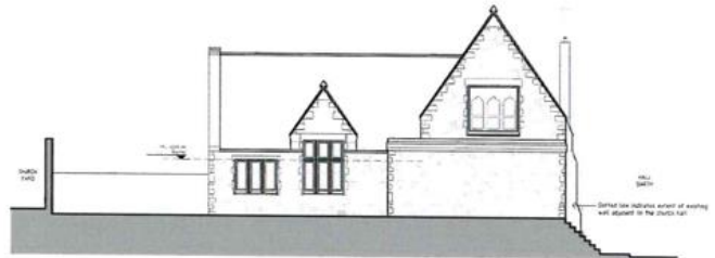
03 Proposed Elevation - South 1:100