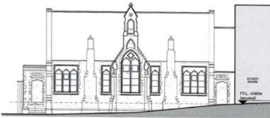
02 Proposed Elevation - East 1:100