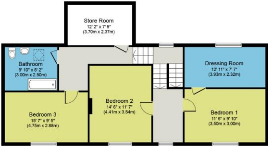
First Floor Approximate Floor Area 978 sq. ft. (90.8 sq. m.)

Whilst every attempt has been made to ensure the accuracy of the floor plan contained here, measurements of doors, windows, rooms and any other items are approximate and no responsibility is taken for any error, omission, or mis-statement. The measurements should not be relied upon for valuation, transaction and/or funding purposes. This plan is for illustrative purposes only and should be used as such by any prospective purchaser or tenant. The services, systems and appliances shown have not been tested and no guarantee as to their operability or efficiency can be given. Copyright V360 Ltd 2024 | www.houseviz.com