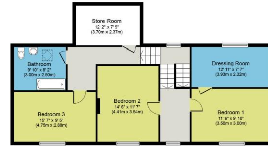
First Floor Approximate Floor Area 978 sq. ft. (90.8 sq. m.)

Whilst every attempt has been made to ensure the accuracy of the floor plan contained here, measurements of doors, windows, rooms and any other items are approximate and no responsibility is taken for any error, omission, or mis-statement. The measurements should not be relied upon for valuation, transaction and/or funding purposes. This plan is for illustrative purposes only and should be used as such by any prospective purchaser or tenant. The services, systems and appliances shown have not been tested and no guarantee as to their operability or efficiency can be given.