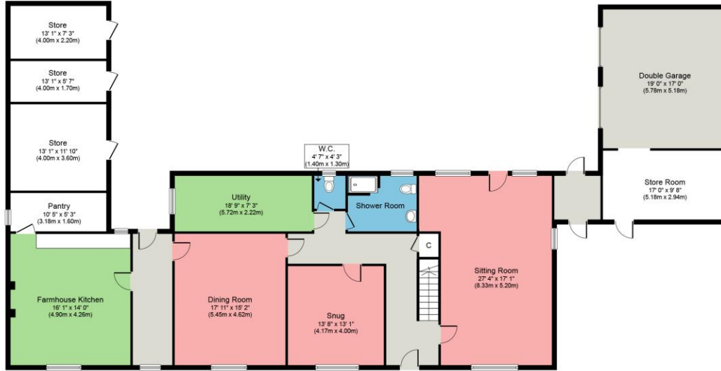
Ground Floor Approximate Floor Area 2,681 sq. ft. (249.1 sq. m.)