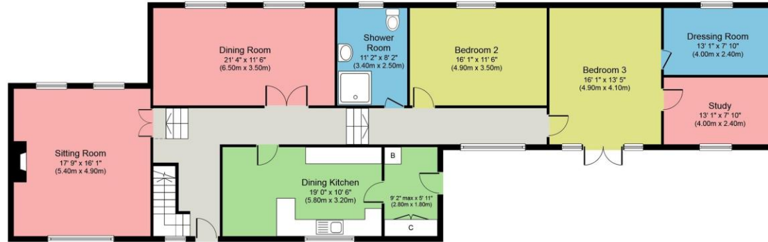
Ground Floor Approximate Floor Area 1,823 sq. ft. (169.4 sq. m.)

Whilst every attempt has been made to ensure the accuracy of the floor plan contained here, measurements of doors, windows, rooms and any other items are approximate and no responsibility is taken for any error, omission, or mis-statement. The measurements should not be relied upon for valuation, transaction and/or funding purposes. This plan is for illustrative purposes only and should be used as such by any prospective purchaser or tenant. The services, systems and appliances shown have not been tested and no guarantee as to their operability or efficiency can be given.