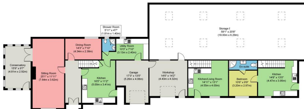
Ground Floor Approximate Floor Area 3184 sq. ft (295.79 sq. m)