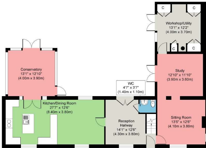
Ground Floor Approximate Floor Area 1207 sq. ft (112.15 sq. m)