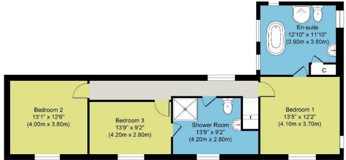
First Floor Approximate Floor Area 859 sq. ft (79.83 sq. m)