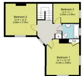
First Floor Approximate Floor Area 570 sq. ft. (53.0 sq. m.)

Whilst every attempt has been made to ensure the accuracy of the floor plan contained herein, measurements of doors, windows, rooms and any other items are approximate and no responsibility is taken for any error, omission, or mis-statement. This plan is for illustrative purposes only and should be used as such by any prospective purchaser or tenant. The services, systems and appliances shown have not been tested and no guarantee as to their operability or efficiency can be given.