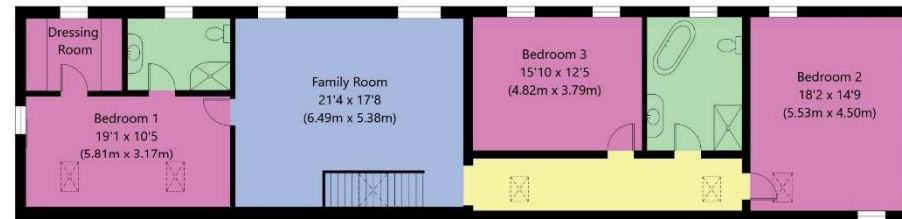
Manor Farm - First Floor GROSS INTERNAL FLOOR AREA APPROX. 1474 SQ FT / 136.95 SQ M

NOT TO SCALE - FOR ILLUSTRATIVE PURPOSES ONLY APPROXIMATE GROSS INTERNAL FLOOR AREA Manor Farm Main House - 3517 SQ FT / 326.72 SQ M - (Excluding Bar/Entertainment Room & Garage)