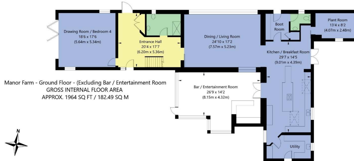
Manor Farm - Ground Floor - (Excluding Bar / Entertainment Room) GROSS INTERNAL FLOOR AREA APPROX. 1964 SQ FT / 182.49 SQ M