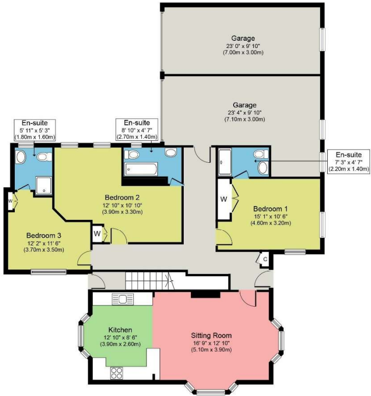
Ground Floor Approximate Floor Area 1,723 sq.ft. (160.1 sq. m.)