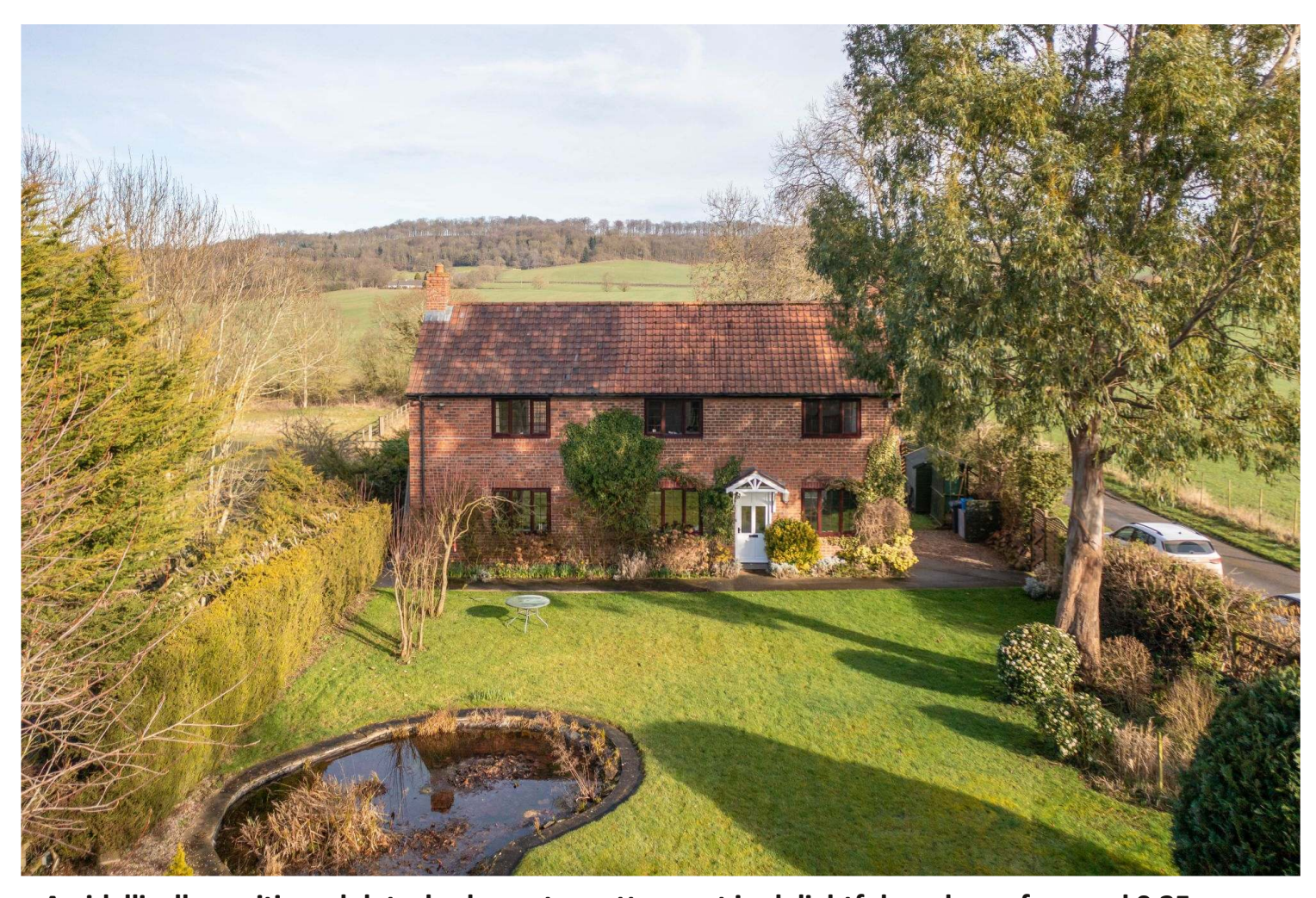
An idyllically positioned detached country cottage set in delightful gardens of around 0.25 acres & enjoying breathtaking views across open countryside, on the edge of an Area of Outstanding Natural Beauty.

Entrance hall, sitting room, open-plan dining kitchen/family room, orangery, utility room, cloakroom, master bedroom with walk-in wardrobe & en-suite shower room, two further double bedrooms & house bathroom. Oil-fired central heating & double-glazing.