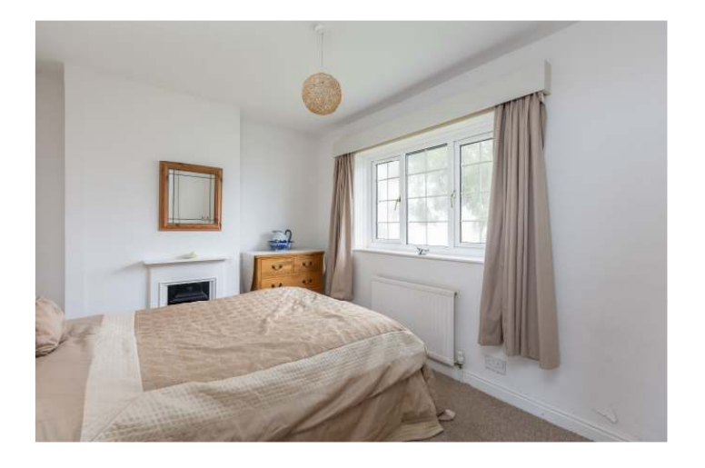
BEDROOM THREE 3.7m x 2.7m (12'2" x 8'10") Casement window to the front. Radiator.