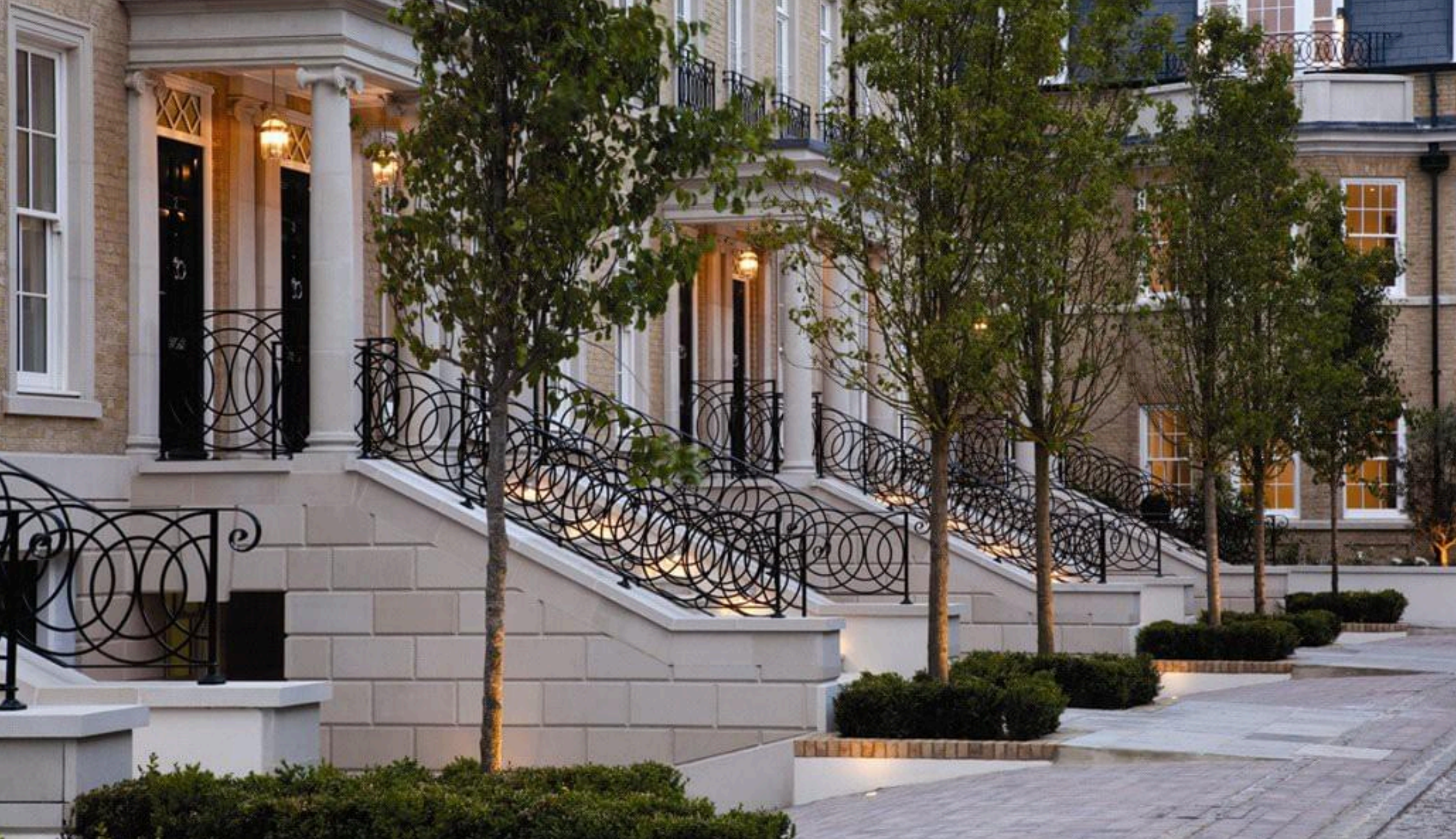
Princess Square, Copsem Lane, Esher, Surrey, KT10