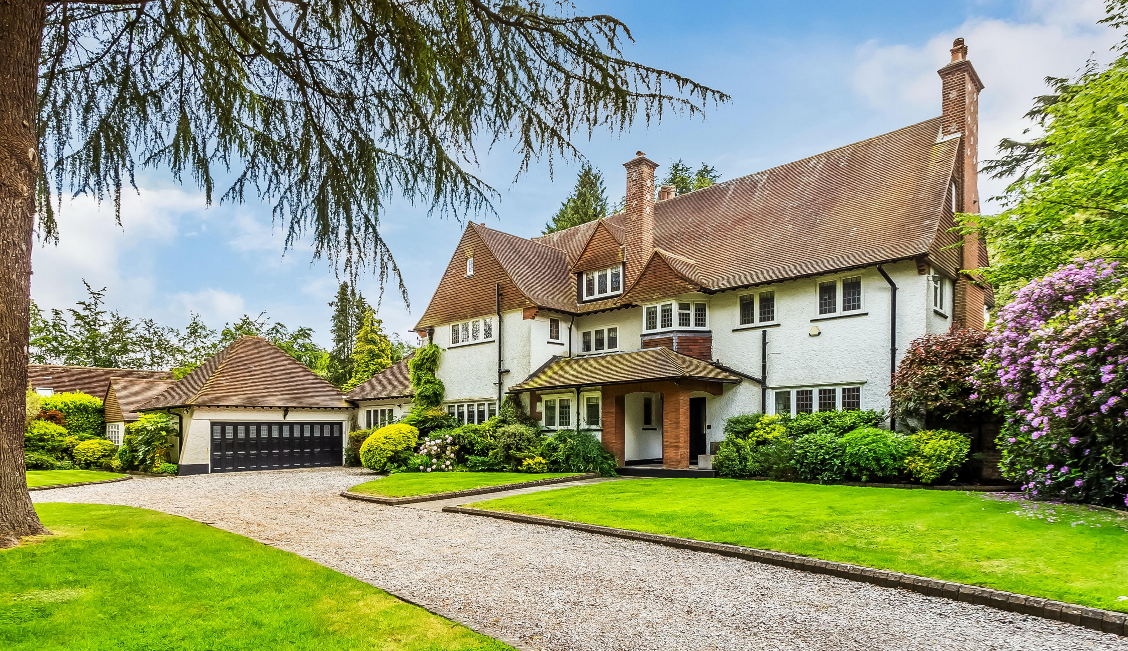
Hurst Drive, Walton On The Hill, Tadworth