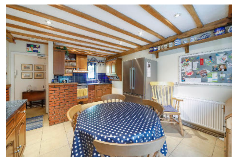
Cherry Tree House is a substantial detached 6 bedroom family home sitting just outside Cirencester with excellent commutable access to the M5. The property sits within a generous private plot of 3.285 acres. The property also includes triple garaging with a large work shop totaling 21ft x 17ft.