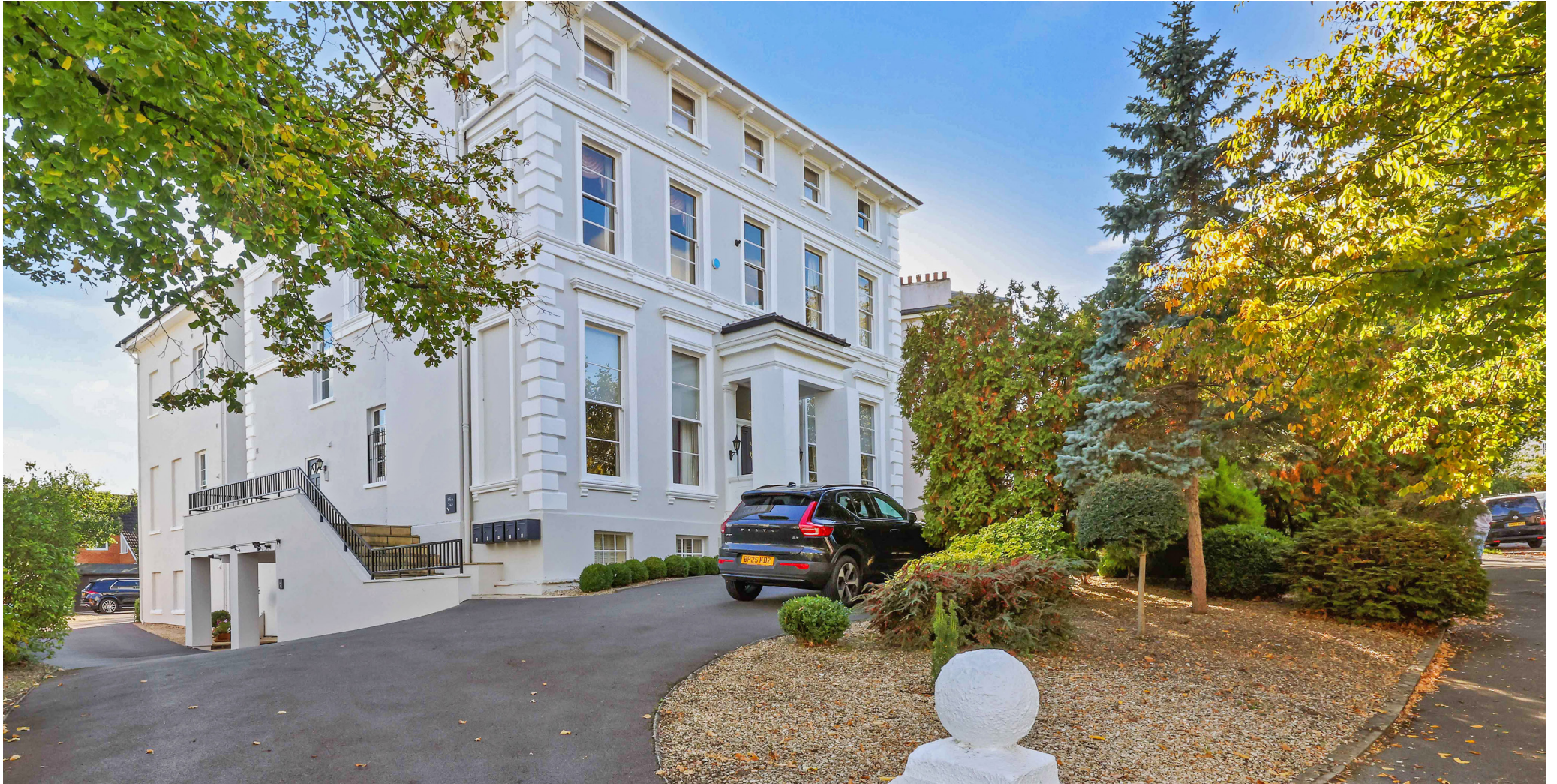
FLAT 5, PARABOLA HOUSE, PARABOLA ROAD CHELTENHAM GL50 3AH