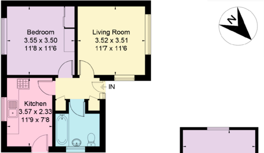
Bungalow (Not Shown In Actual Location / Orientation)