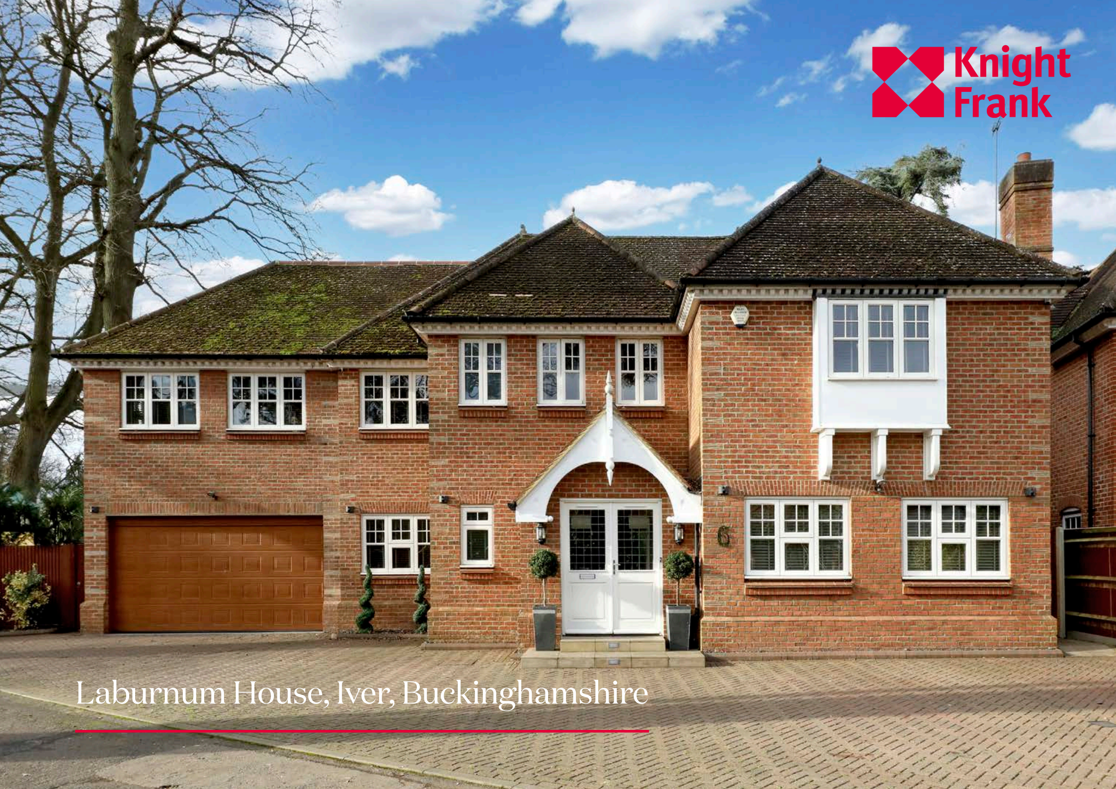
Laburnum House, Iver, Buckinghamshire