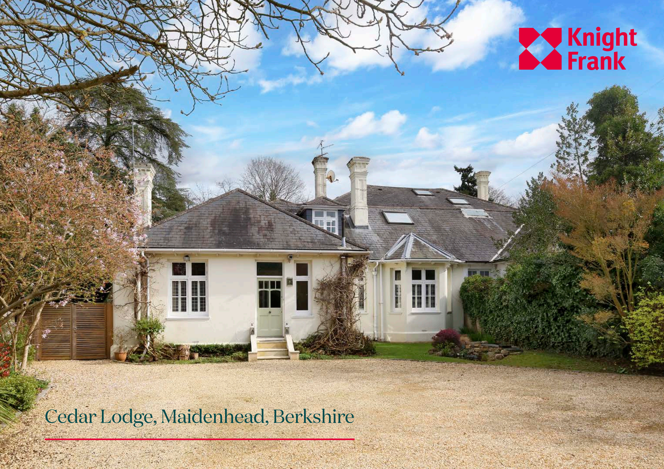
Cedar Lodge, Maidenhead, Berkshire