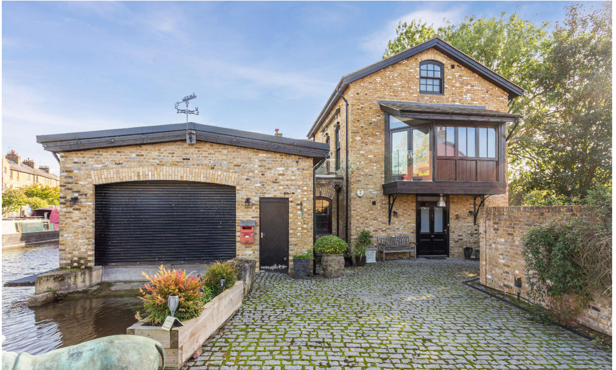
The Old Boathouse, Castle Wharf, Berkhamsted