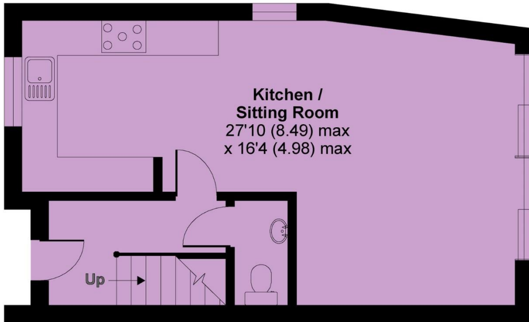
THE RAMPART GROUND FLOOR