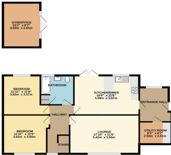
GROUND FLOOR 1068 sq.ft. (99.2 sq.m.) approx.