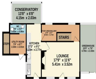
GROUND FLOOR 926 sq.ft. (86.0 sq.m.) approx.