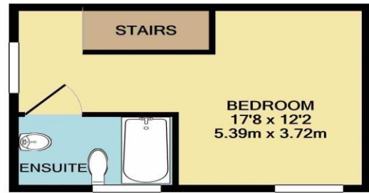
1ST FLOOR APPROX. FLOOR AREA 216 SQ.FT. (20.1 SQ.M.)

TOTAL APPROX. FLOOR AREA 613 SQ.FT. (56.9 SQ.M.)