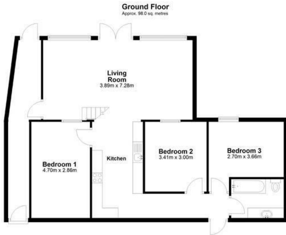
Total area: approx. 98.0 sq. metres Fox And Hounds Cottage, Church Road, Farley Hill, Reading