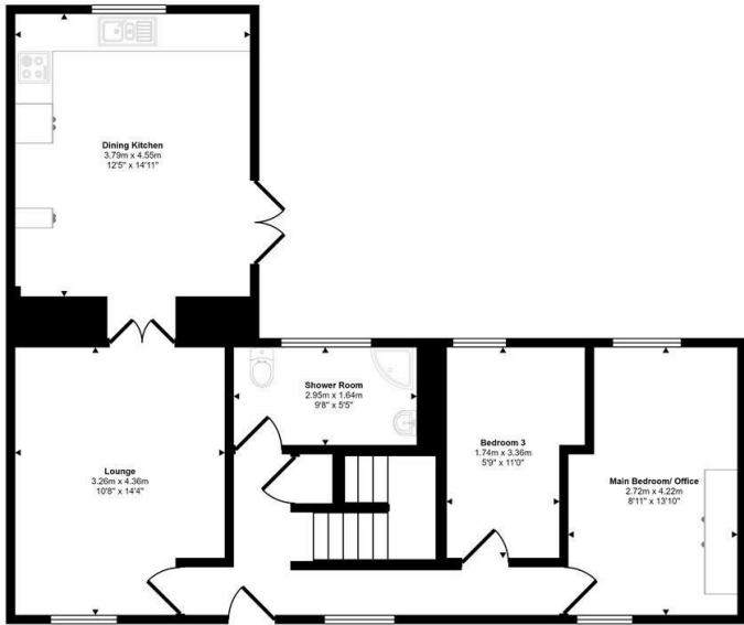
Ground Floor Approx 70 sq m / 751 sq ft

Approx Gross Internal Area 91 sq m / 979 sq ft