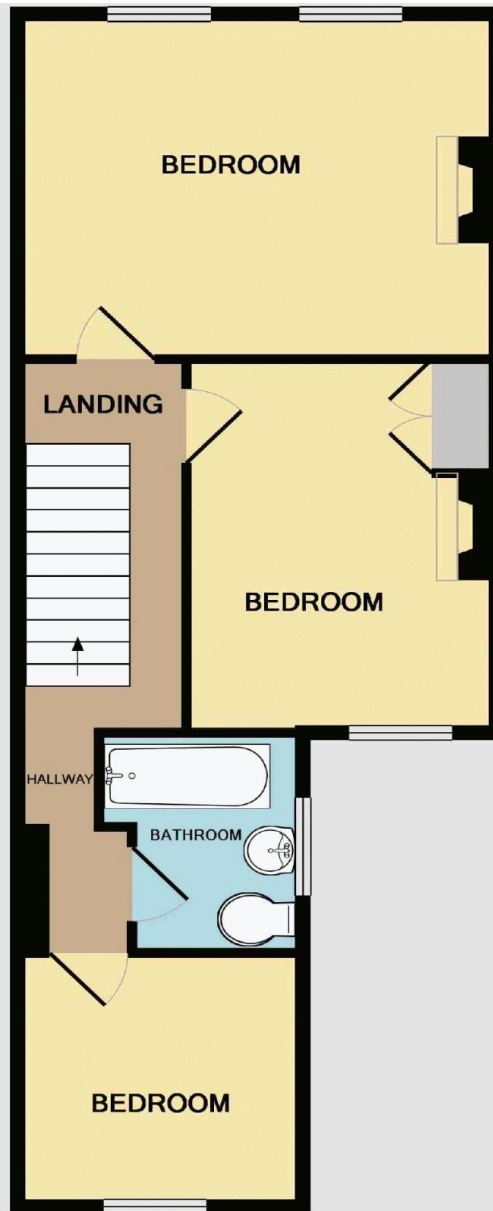
1ST FLOOR APPROX. FLOOR AREA 500 SQ.FT. (46.4 SQ.M.) TOTAL APPROX. FLOOR AREA 1001 SQ.FT. (93.0 SQ.M.) Made with Metropix ©2013