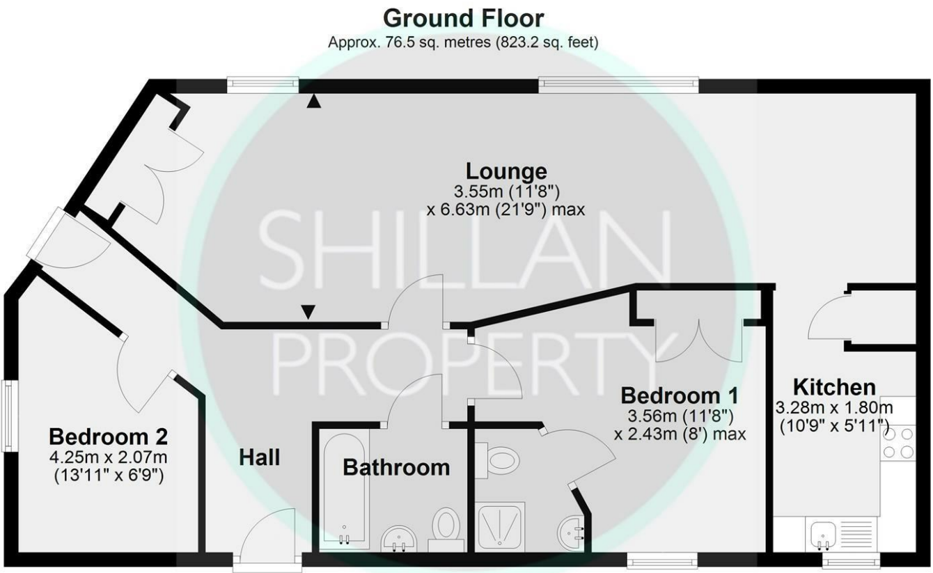
Total area: approx. 76.5 sq. metres (823.2 sq. feet) These images are for representational purposes only. Drawn by Brian Blunden. Plan produced using PlanUp.