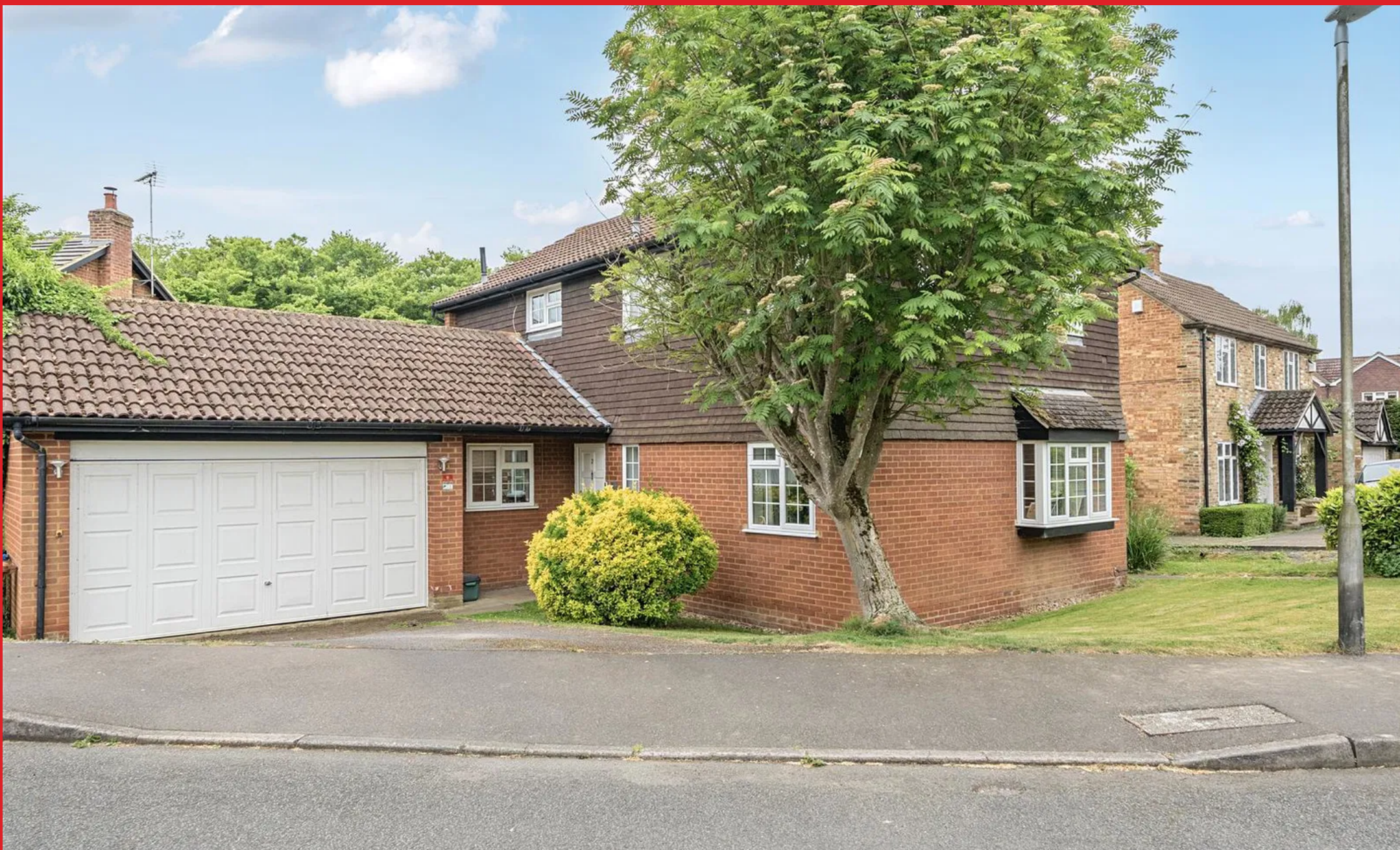
Woodlands, Brookmans Park, Hatfield Hatfield