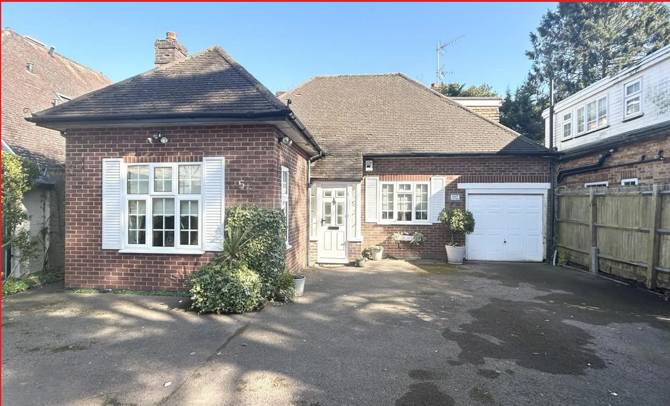
The Rutts, Bushey Heath, Bushey Bushey