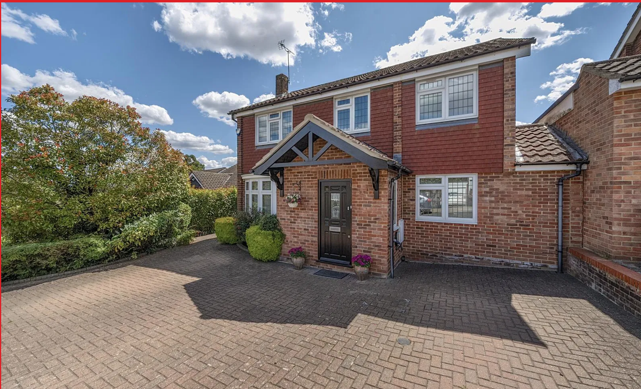
Magnaville Road, Bushey Heath, Bushey Bushey