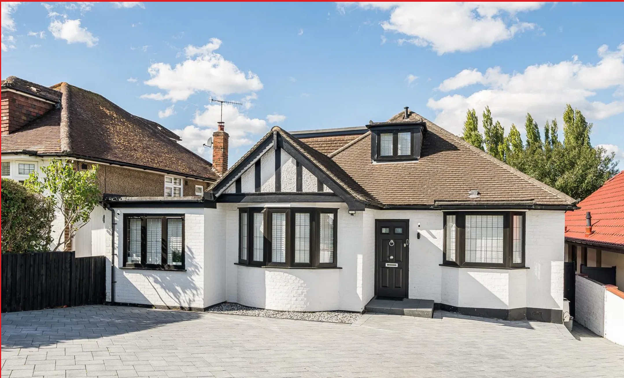
Caldecote Gardens, Bushey Bushey