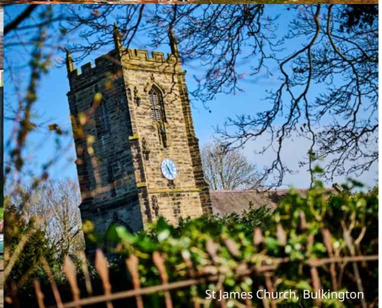
St James Church, Bulkington