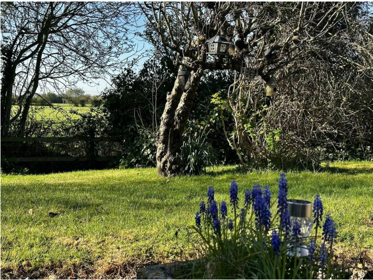
Plot and Location