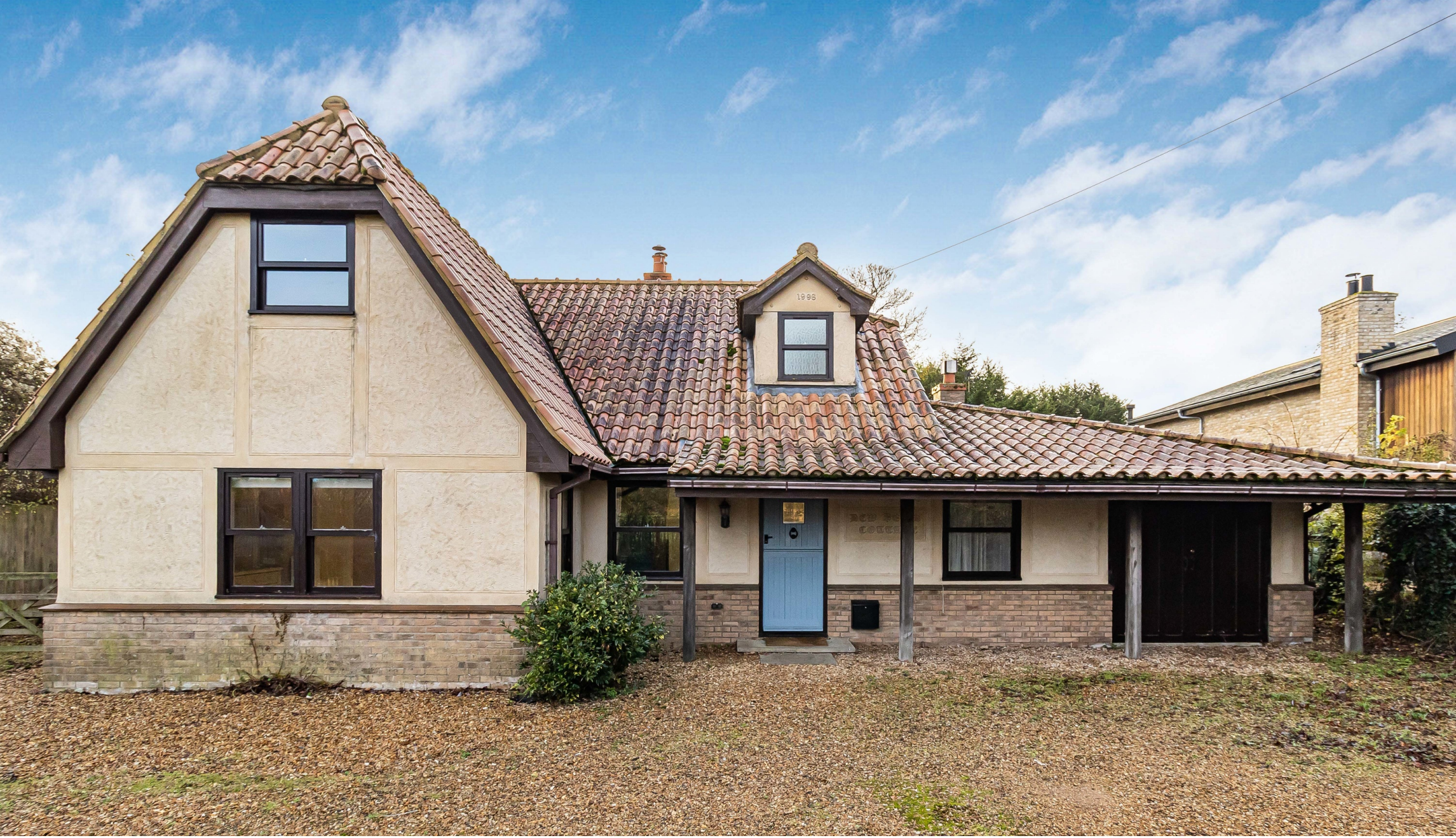
Dew Pond Cottage Conington, CB23 4LP