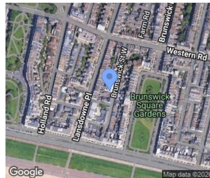
Illustration for identification purposed only, measurements are approximate, not to scale.

Agents Note: Whilst every care has been taken to prepare these particulars, they are for guidance purposes only. All measurements are approximate and are for general guidance purposes only and whilst every care has been taken to ensure their accuracy, they should not be relied upon and potential buyers/tenants are advised to recheck the measurements