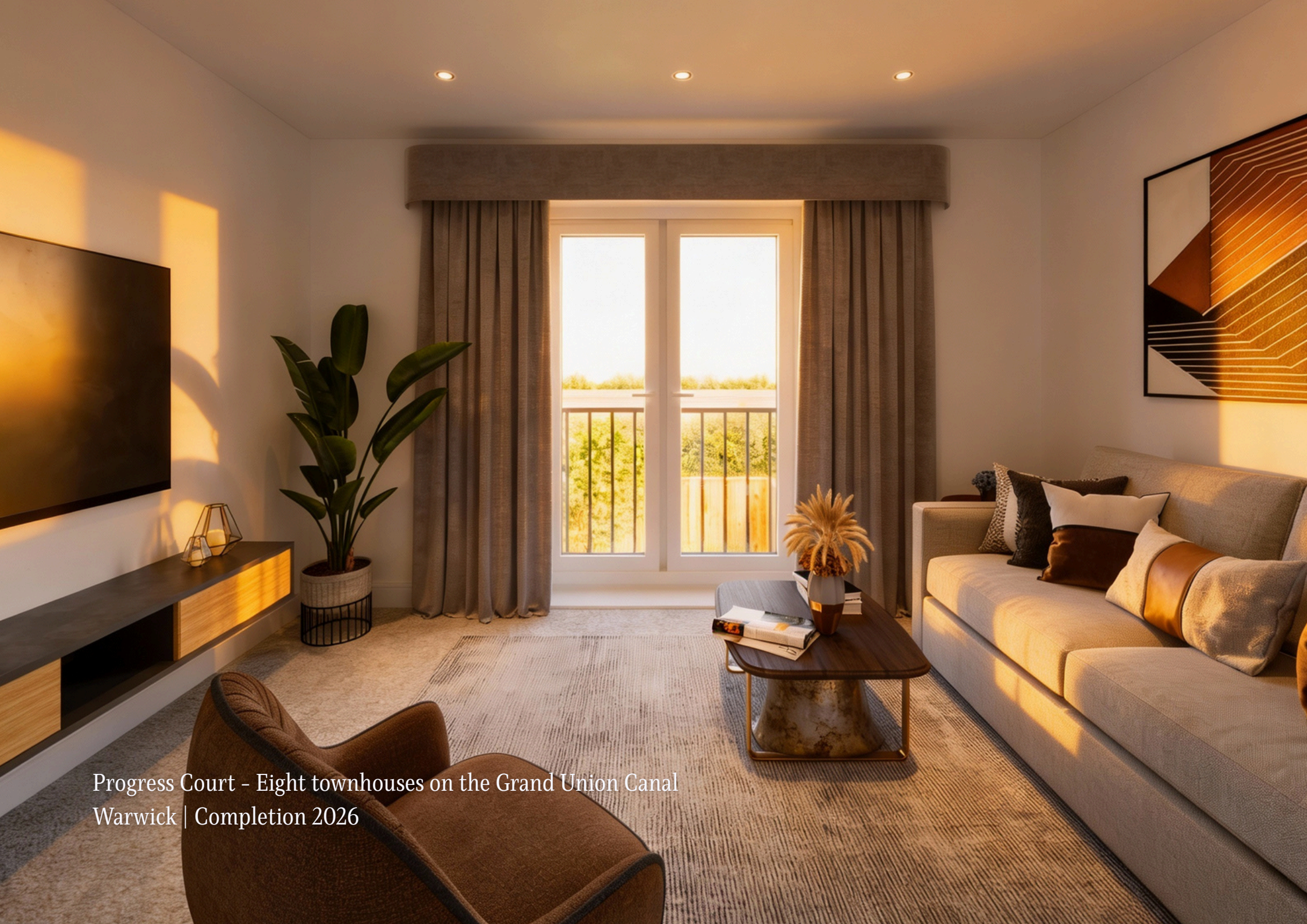
Progress Court - Eight townhouses on the Grand Union Canal Warwick | Completion 2026