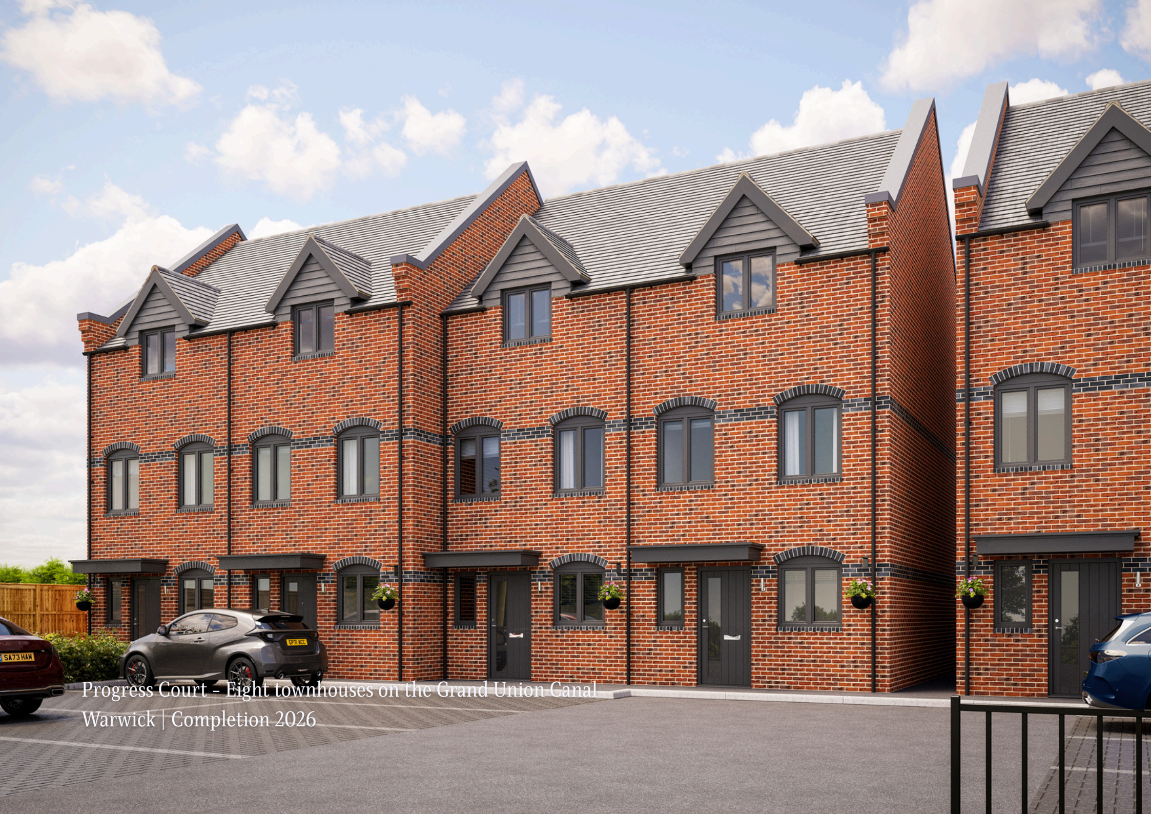
Progress Court - Eight townhouses on the Grand Union Canal Warwick | Completion 2026