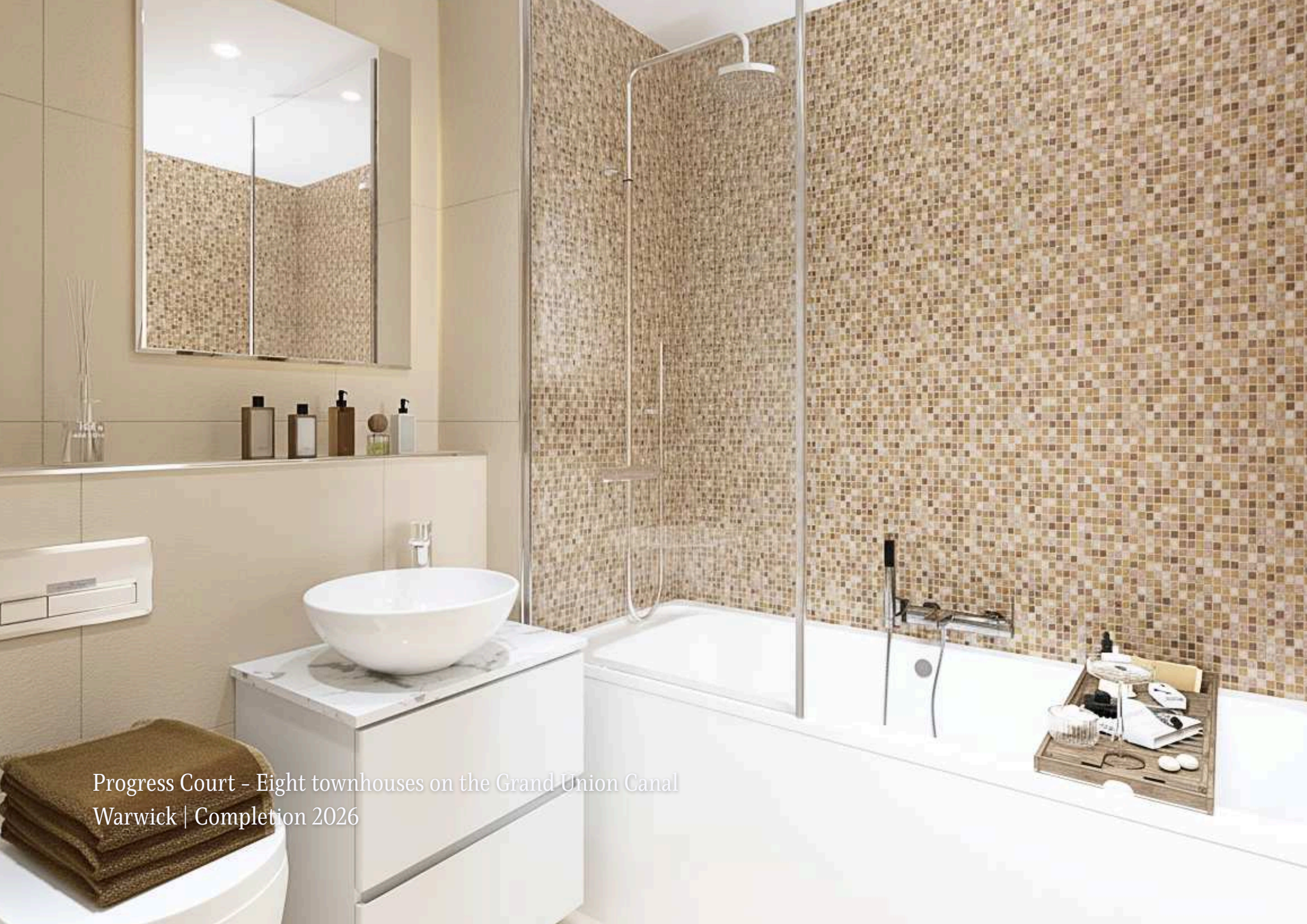
Progress Court - Eight townhouses on the Grand Union Canal Warwick | Completion 2026