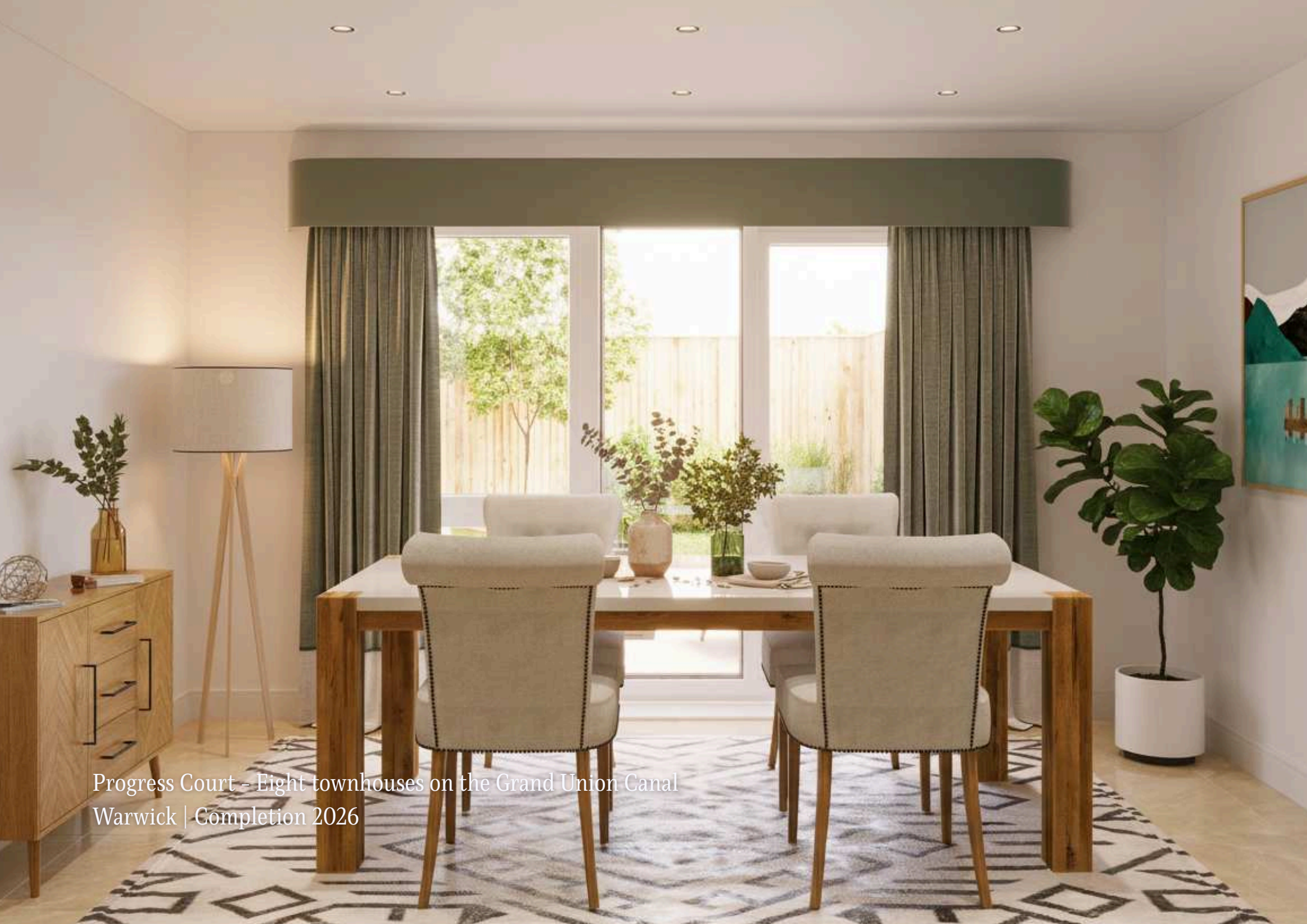
Progress Court - Eight townhouses on the Grand Union Canal Warwick | Completion 2026