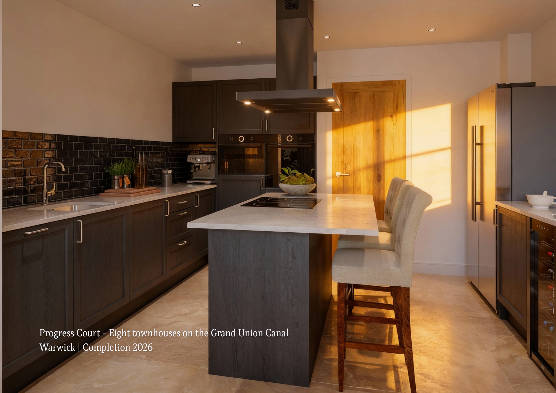
Progress Court - Eight townhouses on the Grand Union Canal Warwick | Completion 2026