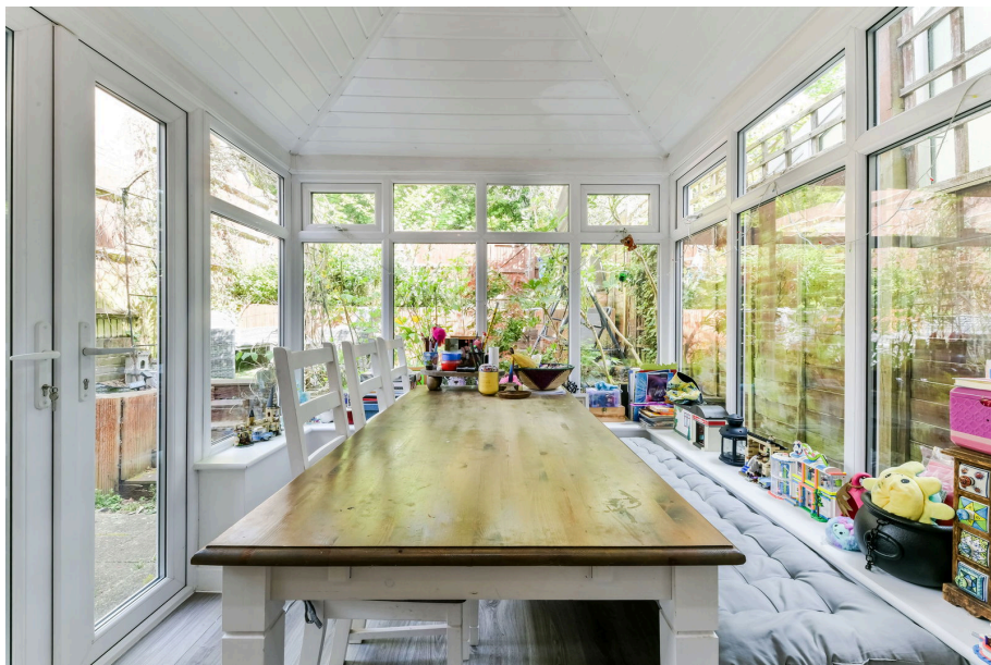
A beautifully presented, bright, end of terrace town house, situated in a quiet location. Convenient for both Redhill and Reigate town centre.